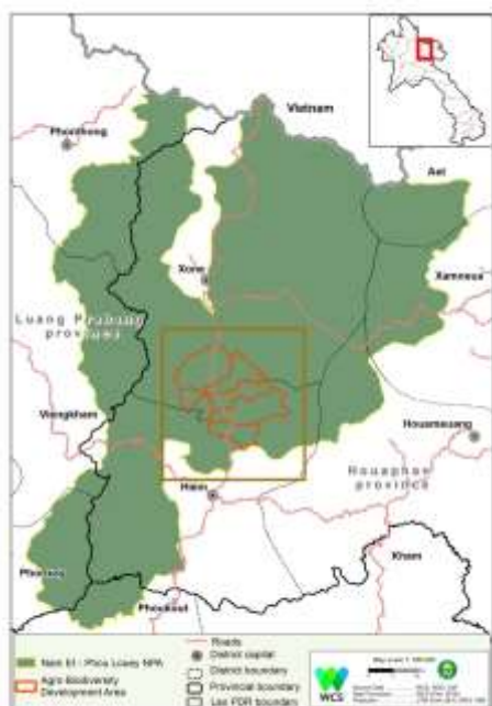
Figure 1: NEPL NPA in relation to Lao PDR with the Boumafath village cluster highlighted in red.

Activities presented in this first annual report focused on the 5 villages of the Boumafath cluster in Xone district.